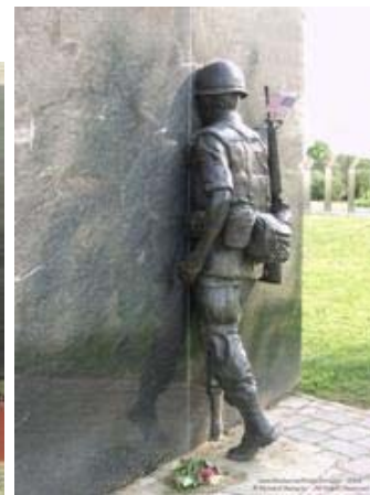
Agent Orange Troop