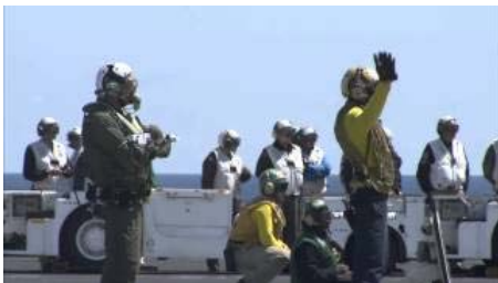
UCAS Aviation History Under Way

Preview YouTube video X-47B UCAS Aviation History Under Way