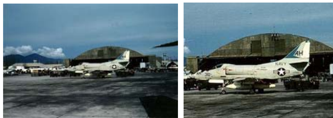
Saints 310 in DaNang with wing damage Oct 1966