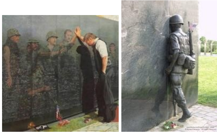
Agent Orange Troop