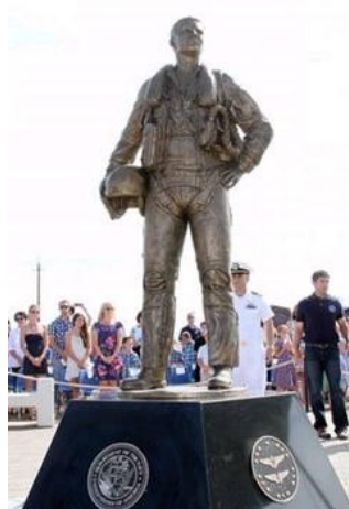
NAS Lemoore memorial