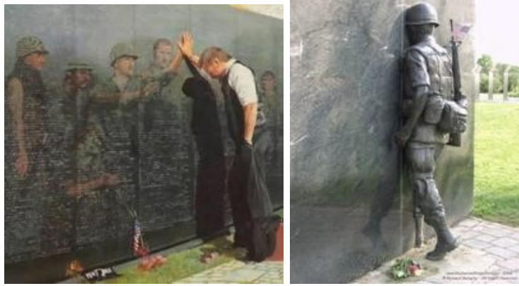
Agent Orange Troop