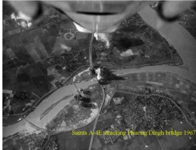
Saints A-4E attacking Phuong Dinh bridge 1967