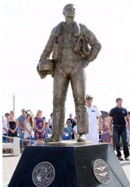
NAS Lemoore memorial