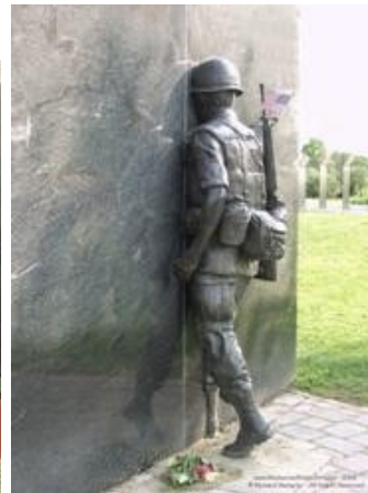
Agent Orange Troop