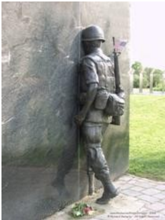
Agent Orange Troop