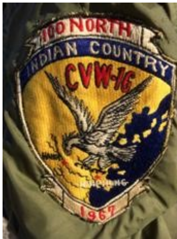
CAG-16 patch 1967