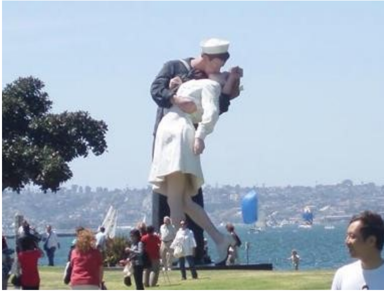
San Diego 2012