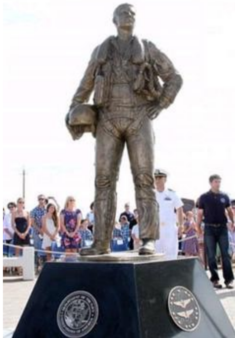
NAS Lemoore memorial